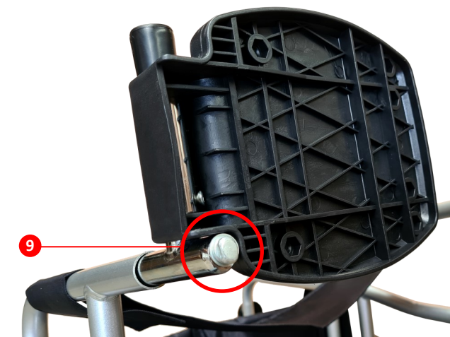
Figure C. Footrest height adjustment