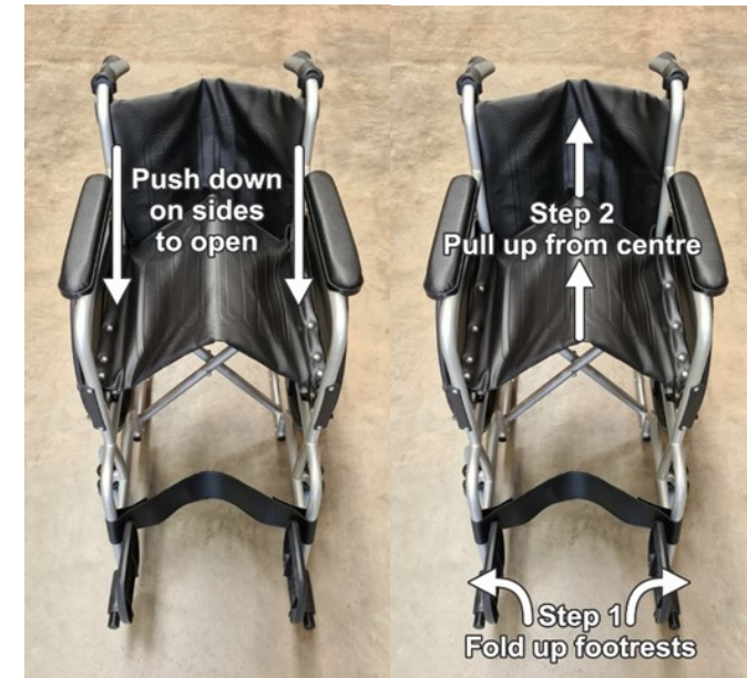
Figure A. Unfolding